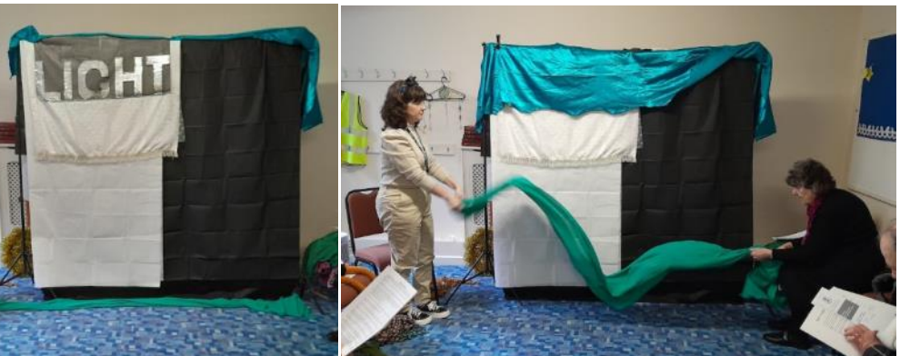
Above left: You wouldn't want to live in the dark, would you? So, with a word of love God said, 'Light'.