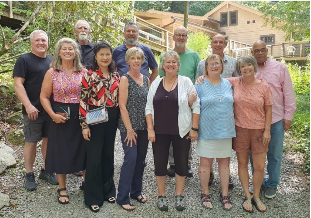
The current PRMI Board Members at last summer's meeting