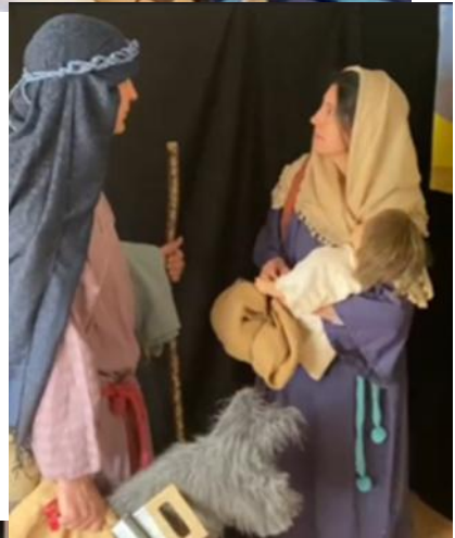
Master Carpenter Nazareth

Thanks to Caesar Augustus, Jesus was born in Bethlehem. Herod's threats resulted in Hosea 11:1 being fulfilled: 'Out of Egypt I called my son'. And when Joseph feared returning to Bethlehem because Judea was ruled by Herod's awful son, Archelaus, God guided Joseph to Nazareth, fulfilling the prophecy of Isaiah 9, that to Galilee of the Gentiles - the people living in darkness have seen a great light; on those living in the land of the shadow of death a light has dawned."