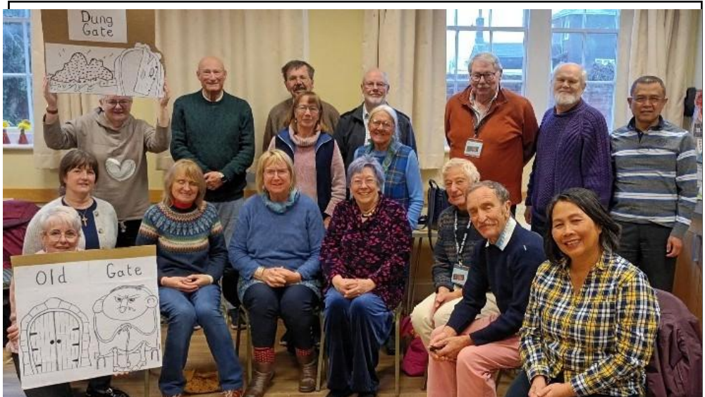
A recent photo of some of the story tellers

Open the Book depends heavily on retired Christians, because storytellers need to be available to take assemblies during the school day. This makes it very difficult in poorer countries where the vast majority of people have no option but to keep working until they are incapable. How blessed we are to live in a country where pensions mean we can stop working for money whilst most of us still have some energy and health – Sprightly Retirees. Do you know